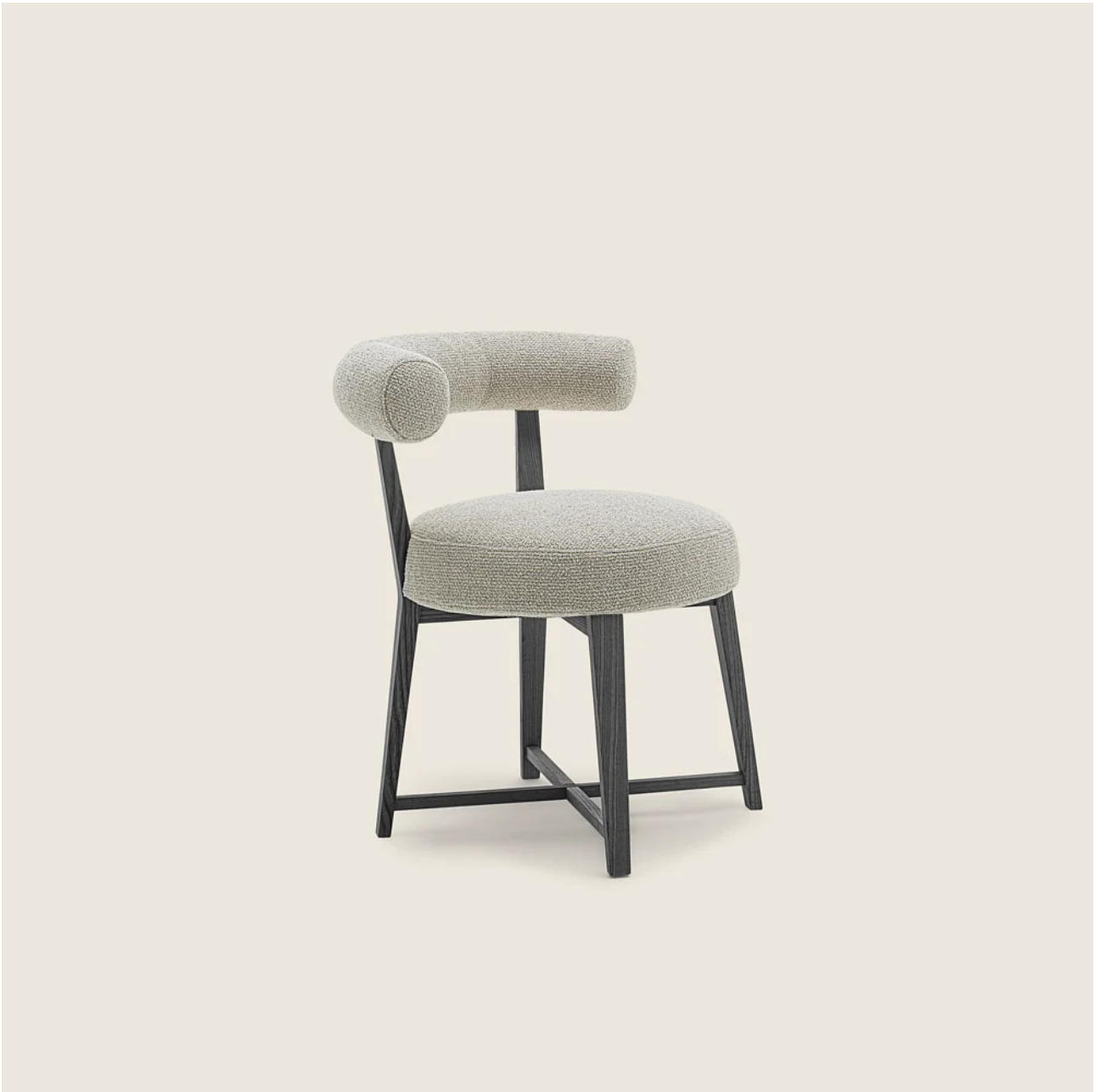
JUSTINE ANTONIO CITTERIO 2026 DINING CHAIRS/CHAIRS